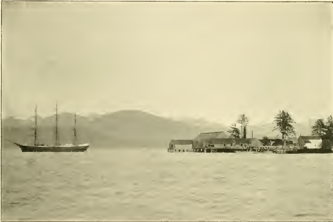
Salmon Cannery, operated by Alaska Packers' Association.